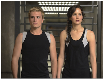
Interview a Hunger-Games Star...