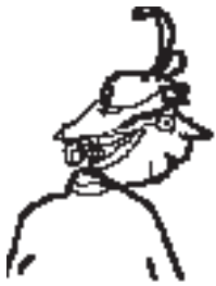
Ethel Draper: Bristol